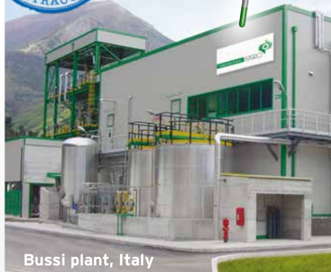
Bussi plant, Italy